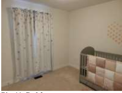
Pic. 11: Bed 2