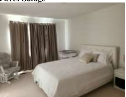
Pic. 8: Master bedroom