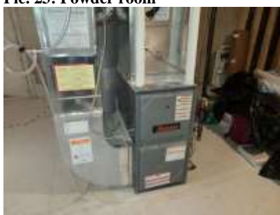
Pic. 26: Gas furnace