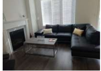
Pic. 17: Living room