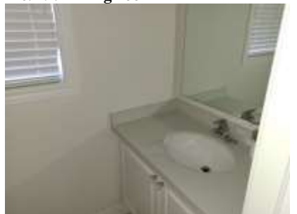
Pic. 22: Powder room