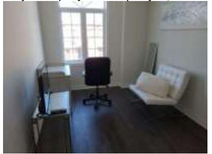
Pic. 16: Bonus room