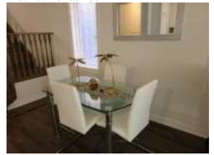
Pic. 19: Dining room