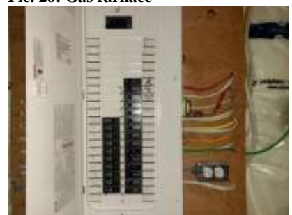
Pic. 29: 200 amp breaker panel