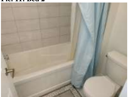
Pic. 14: 2<sup>nd</sup> floor bath