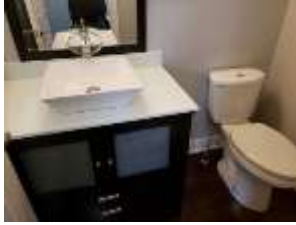
Pic. 21: Powder room