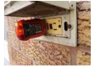
Pic. 4: Exterior GFCI needs replacement