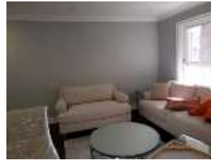
Pic. 15: Living room