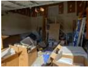
Pic. 5: Garage