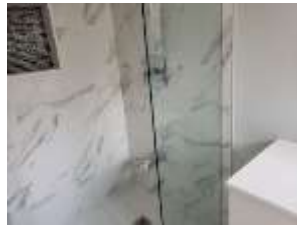
Pic. 10: Master bath