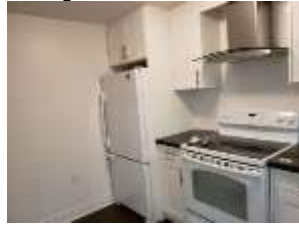
Pic. 26: Basement kitchen