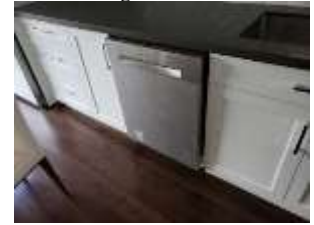
Pic. 20: Kitchen