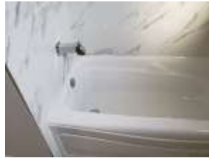
Pic. 14: 2 nd floor bath