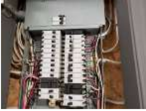
Pic. 29: 100 amp breaker panel