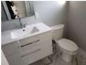
Pic. 9: Master bath