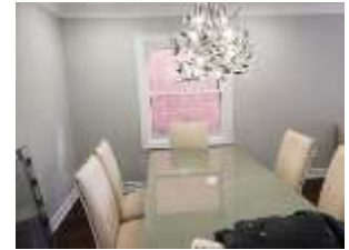
Pic. 16: Dining room