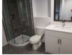
Pic. 23: Basement bath