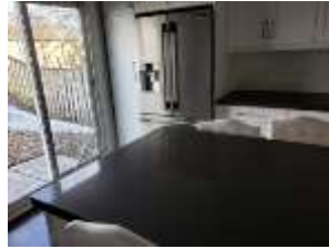
Pic. 18: Eating area