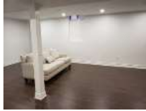
Pic. 22: Rec room