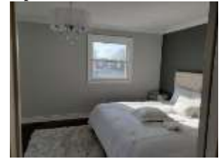
Pic. 8: Master bedroom