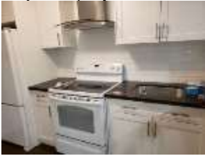
Pic. 25: Basement kitchen