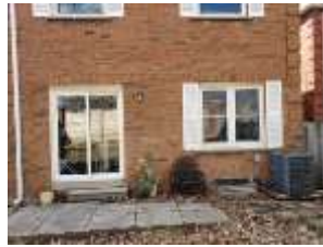
Pic. 2: Back view