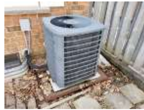
Pic. 3: AC unit