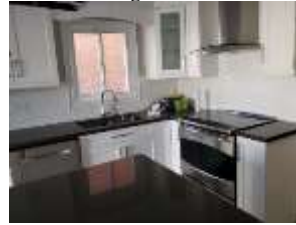
Pic. 19: Kitchen