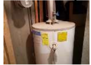
Pic. 28: Rental hot water tank