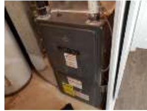
Pic. 27: Gas furnace