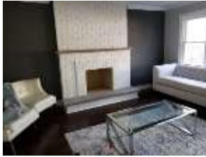
Pic. 17: Family room