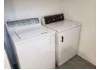
Pic. 24: Laundry