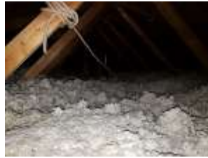
Pic. 6: Attic