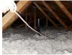
Pic. 7: Open plumbing stack vent pipe in attic