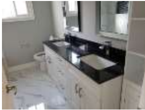
Pic. 13: 2 nd floor bath