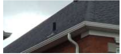
Pic. 3: Roof covering