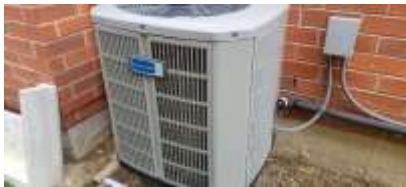
Pic. 7: AC unit 2016