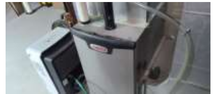
Pic. 33: Gas furnace 2016