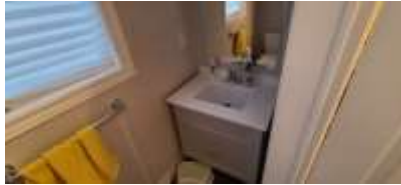
Pic. 26: Powder room