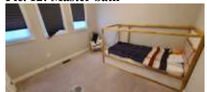
Pic. 15: Bedroom 3