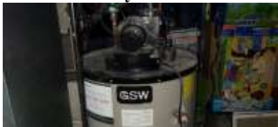
Pic. 31: Rental hot water tank 2015