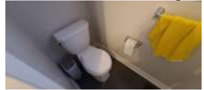
Pic. 27: Powder room