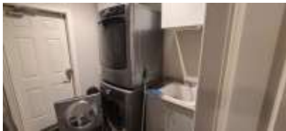
Pic. 28: Laundry