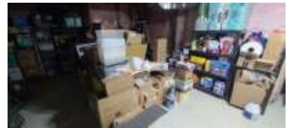
Pic. 30: Basement