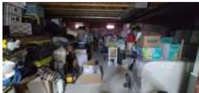
Pic. 29: Basement