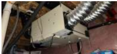
Pic. 32: HRV system