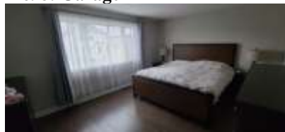
Pic. 11: Master bedroom