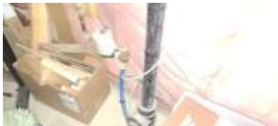
Pic. 34: Water main