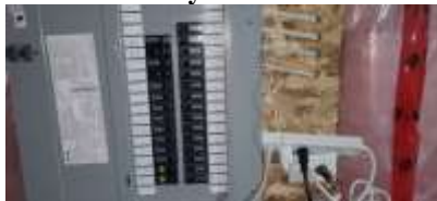
Pic. 35: 200-amp breaker panel