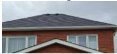
Pic. 5: Roof covering