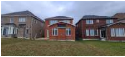
Pic. 4: Back vie