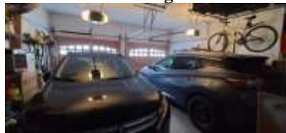
Pic. 8: Garage