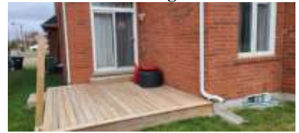
Pic. 6: Deck