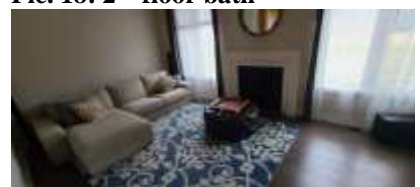
Pic. 21: Family room