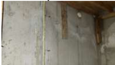
Pic. 26: Professionally repaired foundation crack