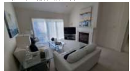
Pic. 15: Living room