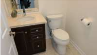
Pic. 22: Powder room