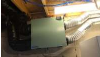
Pic. 32: HRV system