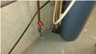
Pic. 31: Water main