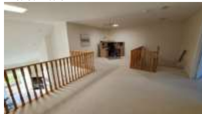
Pic. 11: Loft