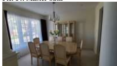
Pic. 17: Dinign room