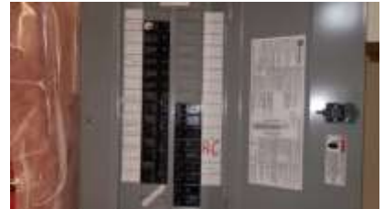
Pic. 33: 100 amp breaker panel