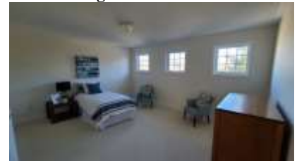
Pic. 9: Bed 2 - Loft