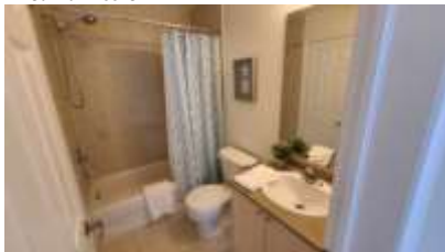
Pic. 10: Loft bathroom