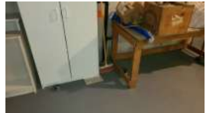
Pic. 27: Rough in for bathroom