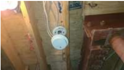
Pic. 34: Basement and main floor smoke detectors are dated and should be replaced.