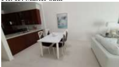
Pic. 16: Eating area