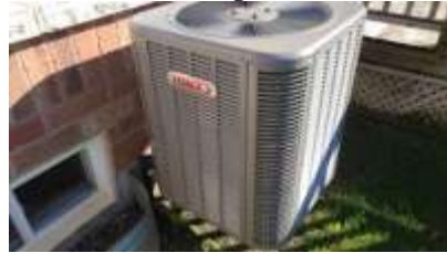
Pic. 5: AC unit 2018