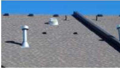
Pic. 4: Roof covering