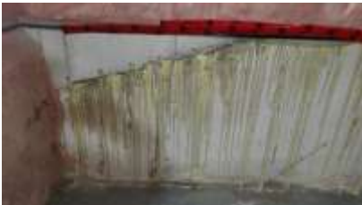
Pic. 25: Professionally repaired foundation crack