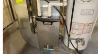
Pic. 30: Gas furnace 2020