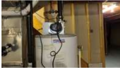
Pic. 29: Hot water tank 2006