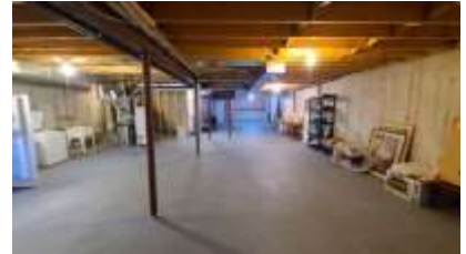
Pic. 24: Unfinished basement