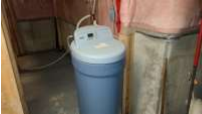
Pic. 28: Water softener