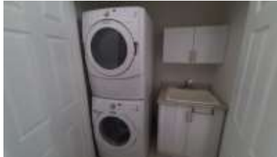
Pic. 23: Laundry