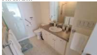
Pic. 14: Master bath