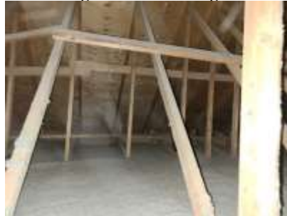
Pic. 5: Attic