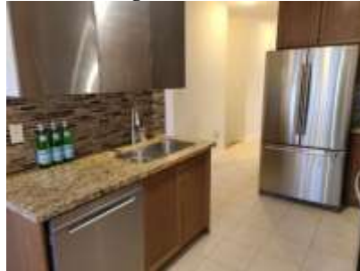
Pic. 20: Kitchen