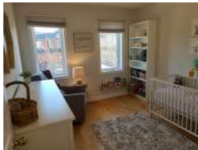
Pic. 11: Bed 3