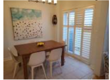
Pic. 18: Eating area