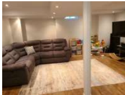
Pic. 23: Rec room