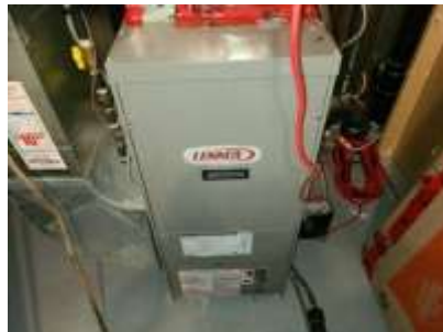
Pic. 26: Original gas furnace 2006