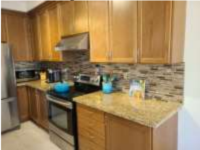
Pic. 19: Kitchen