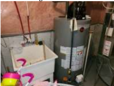
Pic. 25: Rental hot water tank