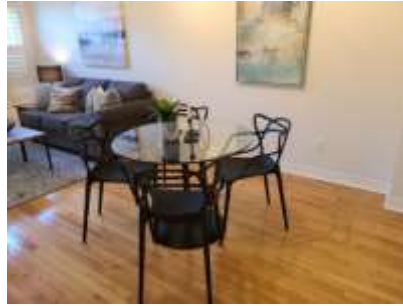
Pic. 17: Dining room