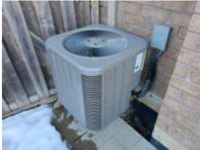
Pic. 4: AC unit 2020