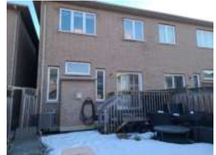
Pic. 3: Back view