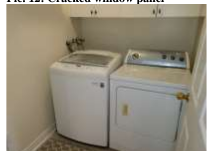
Pic. 15: Laundry