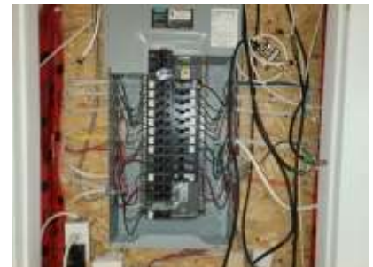
Pic. 27: 100 amp breaker panel with all copper wire