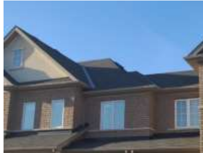
Pic. 2: Original roof covering