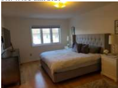
Pic. 7: Master bedroom – right window lock broken and window cannot be opened