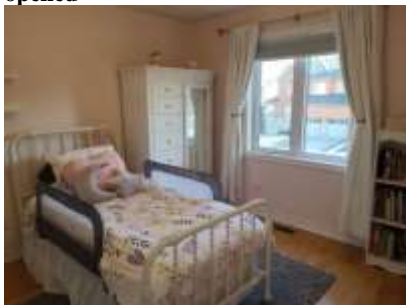
Pic. 10: Bed 2