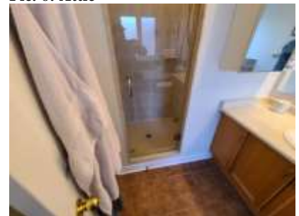
Pic. 9: Master bath