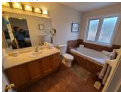
Pic. 8: Master bath