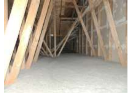
Pic. 6: Attic