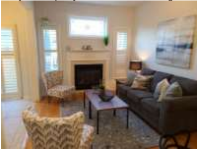
Pic. 16: Living room