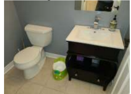
Pic. 21: Powder room