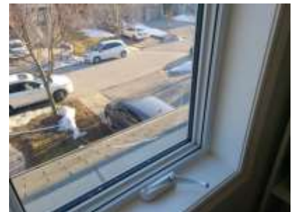
Pic. 12: Cracked window panel