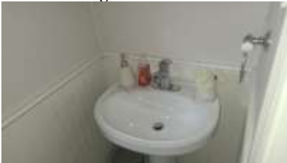
Pic. 25: Powder room