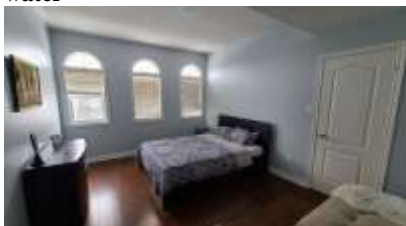
Pic. 16: Bed 4