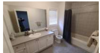
Pic. 18: 2 nd floor bath