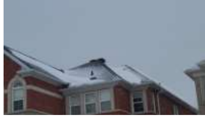
Pic. 2: Roof covering, snow covered