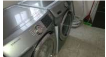
Pic. 27: Laundry