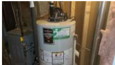
Pic. 35: Rental hot water tank 2011