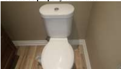
Pic. 34: Basement bath – toilet not working