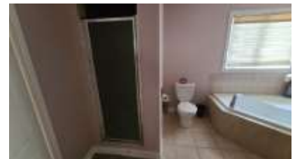
Pic. 12: Master bath