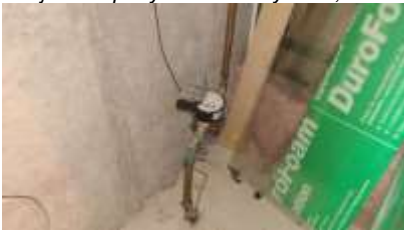
Pic. 37: Water main