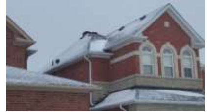
Pic. 3: Roof covering, snow covered