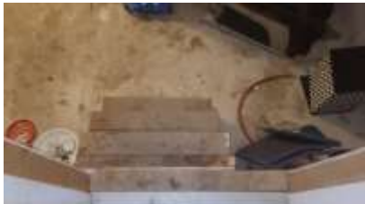
Pic. 7: Garage stairs improperly sized and a trip hazard