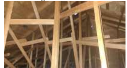
Pic. 9: Attic