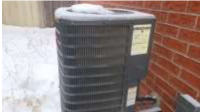
Pic. 4: AC unit 2018