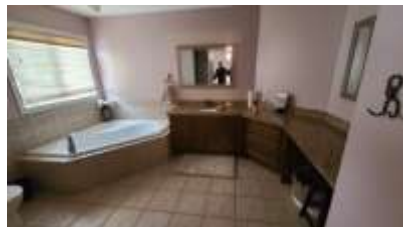
Pic. 11: Master bath