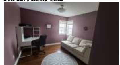
Pic. 15: Bed 3