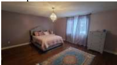
Pic. 10: Master bedroom