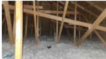
Pic. 8: Attic