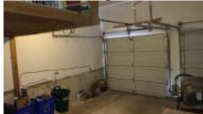
Pic. 5: Garage