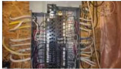
Pic. 38: 100 amp breaker panel