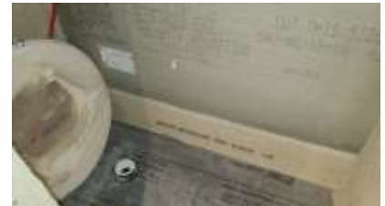
Pic. 33: Basement bath – shower roughed in and not completed