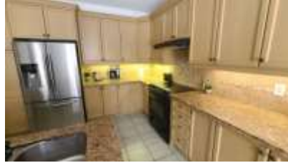
Pic. 23: Kitchen