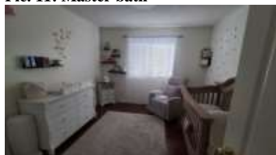
Pic. 14: Bed 2