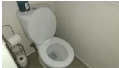
Pic. 26: Powder room