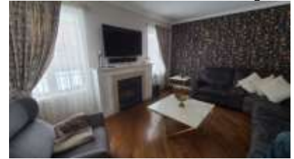
Pic. 21: Family room