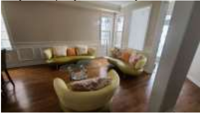
Pic. 19: Living room