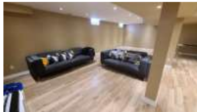
Pic. 29: Rec room