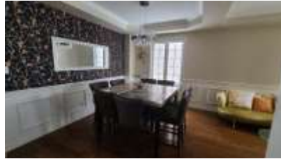
Pic. 20: Dining room