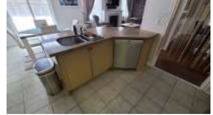
Pic. 24: Kitchen