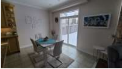
Pic. 22: Eating area