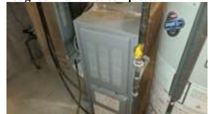
Pic. 36: Original gas furnace