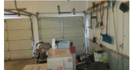
Pic. 6: Garage