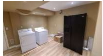
Pic. 30: Rough in kitchen