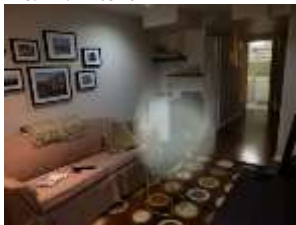
Pic. 21: Rec room