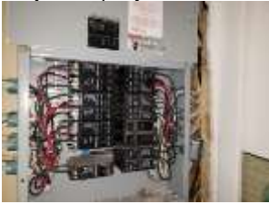
Pic. 25: 100 amp breaker panel with all copper wire