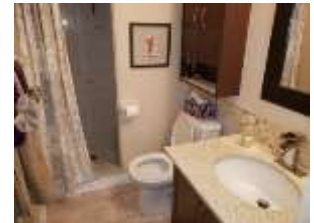
Pic. 12: Master bath