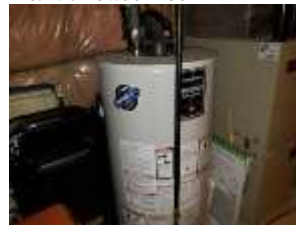
Pic. 23: Rental hot water tank