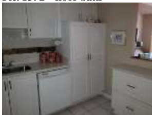
Pic. 17: Kitchen