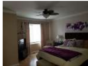
Pic. 11: Master bedroom