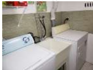
Pic. 22: Laundry