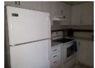
Pic. 16: Kitchen