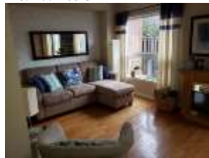
Pic. 14: Living room