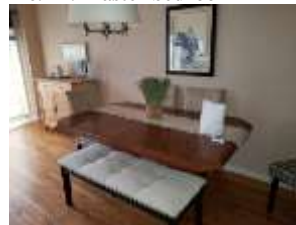
Pic. 15: Dining room