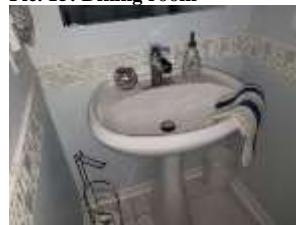
Pic. 19: Powder room