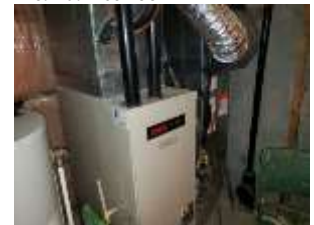
Pic. 24: Original gas furnace