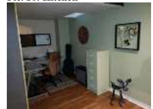
Pic. 20: Rec room