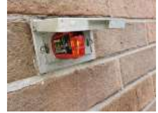
Pic. 4: Rear GFCI outlet won't trip needs replacement