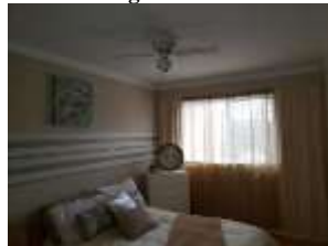
Pic. 10: Bed 3