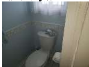
Pic. 18: Powder room