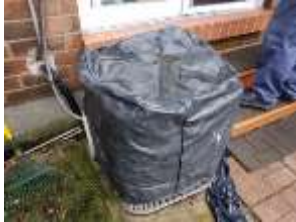
Pic. 5: AC unit 2002