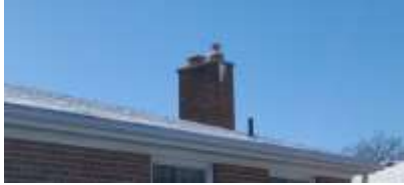
Pic. 4: Chimney