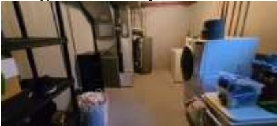
Pic. 28: Laundry / Utility room