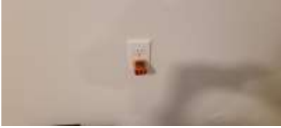
Pic. 25: Outlet in basement kitchen eating area has no power