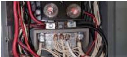
Pic. 34: Main lugs double tapped for stove and dryer disconnects