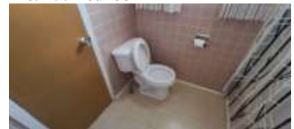
Pic. 18: Main bath