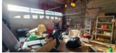
Pic. 5: Garage