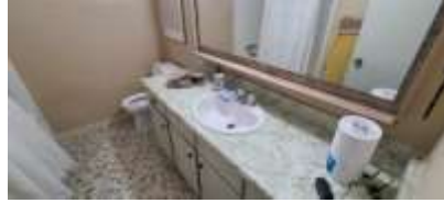
Pic. 26: Basement bath