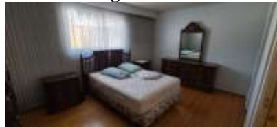
Pic. 14: Master bedroom