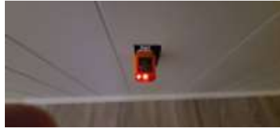
Pic. 23: One outlet in in basement living are wired with a reverse polarity