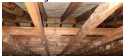
Pic. 8: Attic