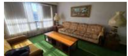
Pic. 9: Living room