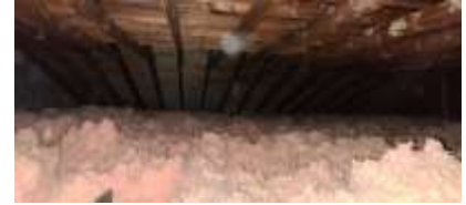
Pic. 6: Attic