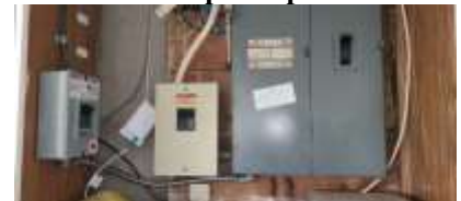
Pic. 36: Stove and dryer disconnects