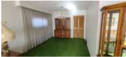
Pic. 10: Dining room