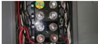
Pic. 35: Several circuits over fused for wire size