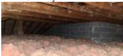
Pic. 7: Attic