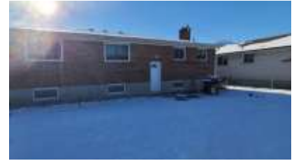
Pic. 3: Back view