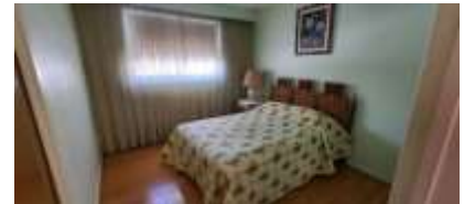
Pic. 15: Bedroom 2