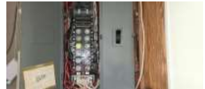
Pic. 33: 100 amp fuse panel