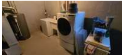
Pic. 29: Laundry