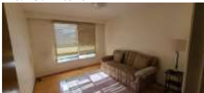
Pic. 16: Bedroom 3