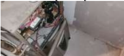
Pic. 31: Gas furnace 2009