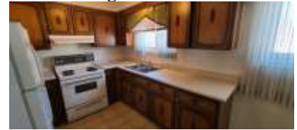
Pic. 12: Kitchen