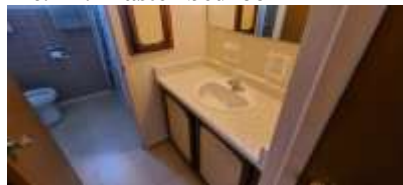
Pic. 17: Main bath