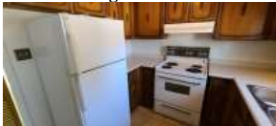
Pic. 13: Kitchen