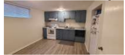
Pic. 24: Basement kitchen