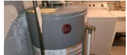
Pic. 30: Hot water tank 2018