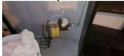
Pic. 32: Water main