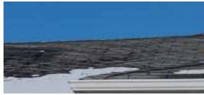
Pic. 2: Aging roof covering