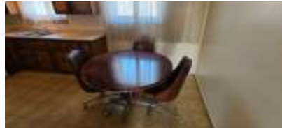
Pic. 11: Eating area