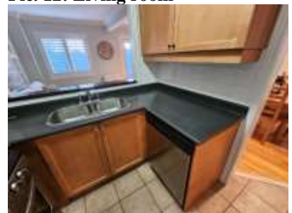
Pic. 15: Kitchen