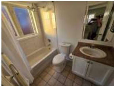
Pic. 8: Primary bathroom