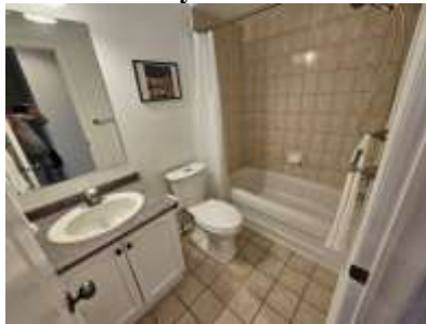
Pic. 11: 2nd floor bathroom