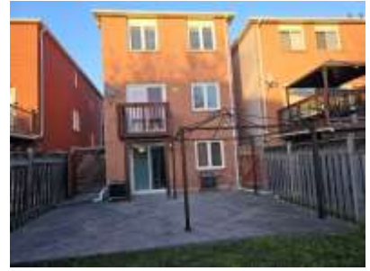
Pic. 3: Back view