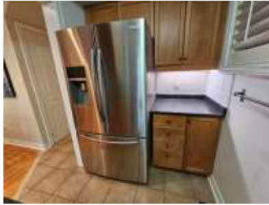
Pic. 17: Kitchen