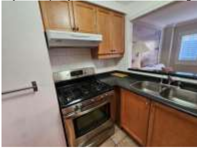
Pic. 16: Kitchen