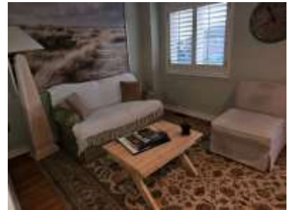
Pic. 12: Living room