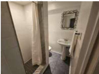
Pic. 22: Basement bathroom