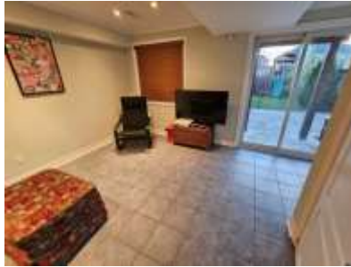
Pic. 20: Rec room