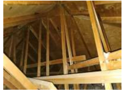
Pic. 6: Attic