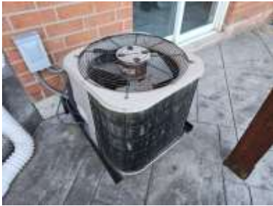
Pic. 4: AC unit 2003