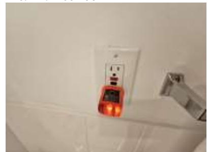
Pic. 24: Bathroom GFCI defective and needs to be replaced