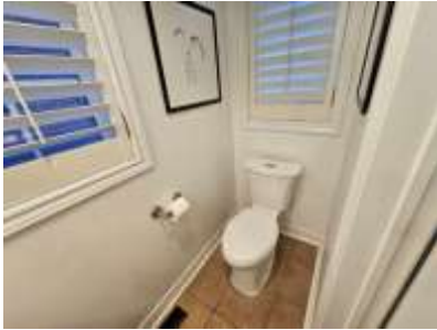
Pic. 19: Powder room