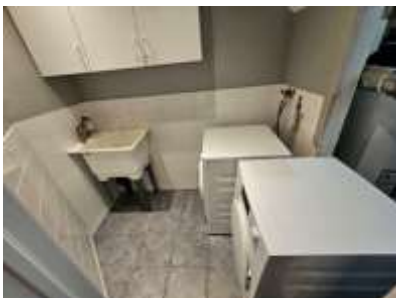
Pic. 25: Laundry room