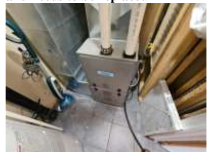
Pic. 27: Gas furnace 2019