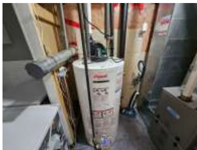
Pic. 26: Water heater 2013