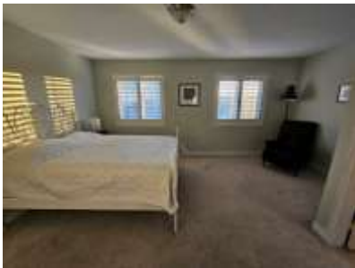
Pic. 7: Primary bedroom