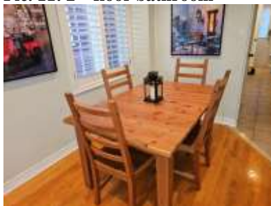
Pic. 14: Dining room