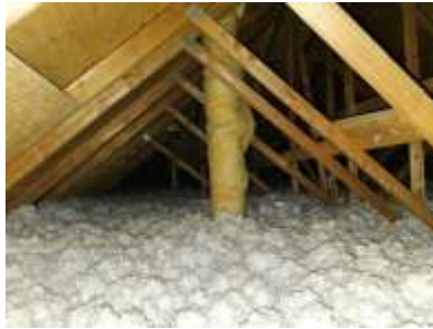
Pic. 5: Attic