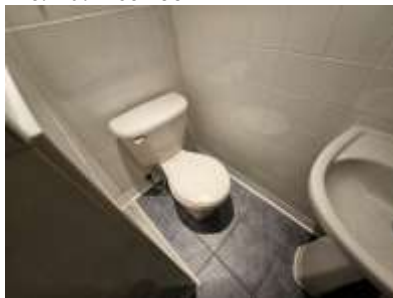
Pic. 23: Basement bathroom