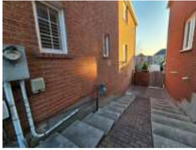
Pic. 2: Side view