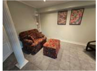
Pic. 21: Rec room