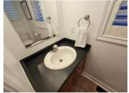
Pic. 18: Powder room