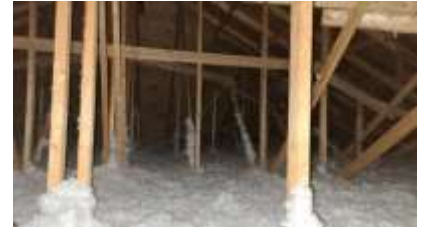
Pic. 6: Attic