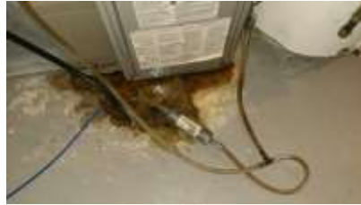
Pic. 38: AC appears to be leaking at the furnace and should be serviced