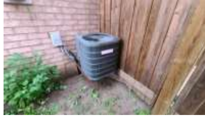
Pic. 2: AC unit 2005