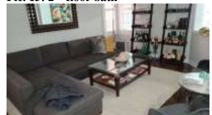
Pic. 18: Living room