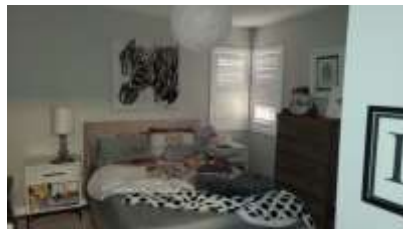
Pic. 14: Bed 3