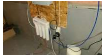
Pic. 33: RO filter system