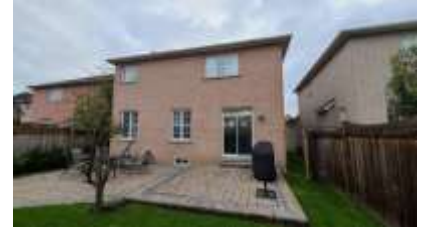
Pic. 3: Back view