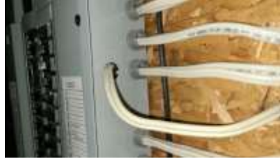
Pic. 41: A proper grommet is needed for the wire entering the panel