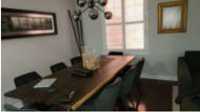
Pic. 19: Dining room