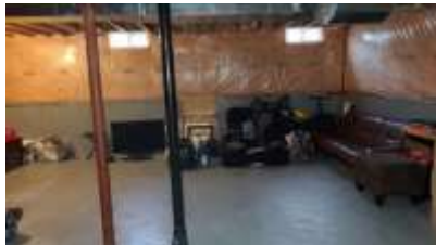
Pic. 29: Basement