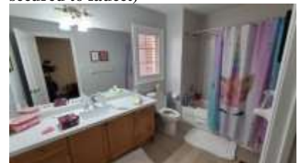
Pic. 15: 2 nd floor bath