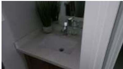
Pic. 26: Powdewr room