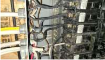
Pic. 40: 2 breaker double tapped and one of the double tapped has mismatched wire and breaker size