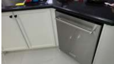
Pic. 23: Kitchen