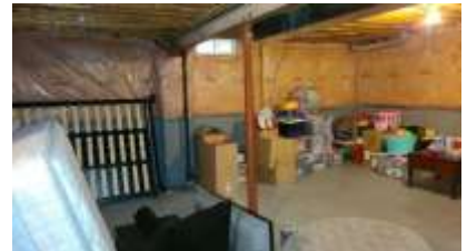
Pic. 30: Basement