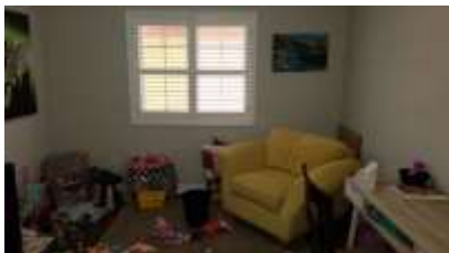
Pic. 13: Bed 2