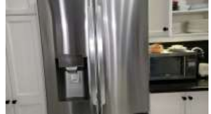
Pic. 24: Kitcehn