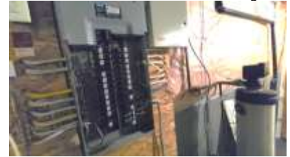
Pic. 39: 100-amp breaker panel