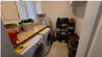
Pic. 28: Laundry