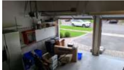
Pic. 5: Garage