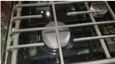
Pic. 25: Front left burner igniter not working