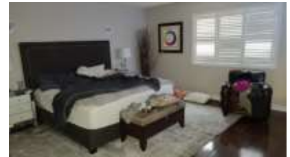
Pic. 9: Master bedroom