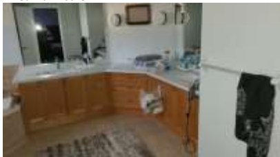
Pic. 10: Master bath