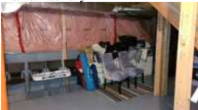
Pic. 31: Basement