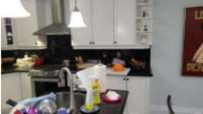
Pic. 22: Kitchen