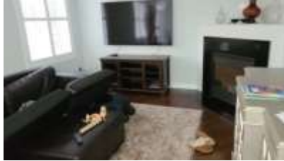
Pic. 20: Family room