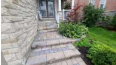
Pic. 4: Front steps