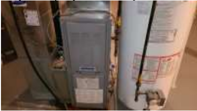
Pic. 37: Original gas furnace