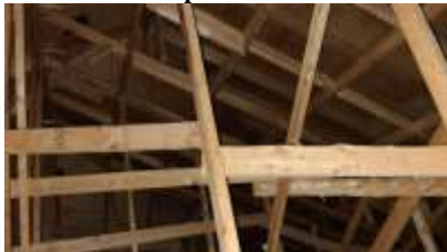
Pic. 7: Attic