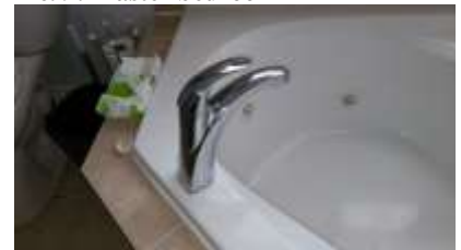
Pic. 12: Tub faucet handle broken (not secured to faucet)