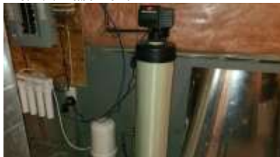
Pic. 32: Water softener