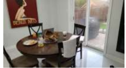
Pic. 21: Eating area