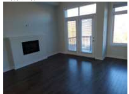
Pic. 12: Family room