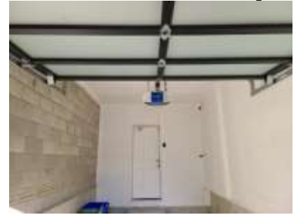
Pic. 18: Garage