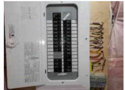
Pic. 24: 100 amp breaker panel