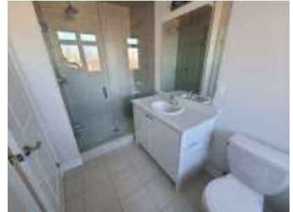
Pic. 6: Master bath