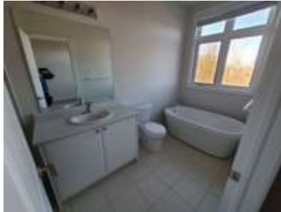
Pic. 5: Master bath