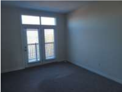
Pic. 4: Master bedroom