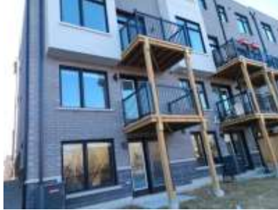
Pic. 2: Back view