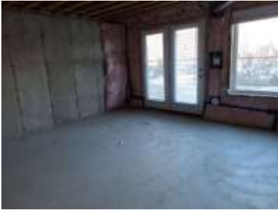
Pic. 19: Basement