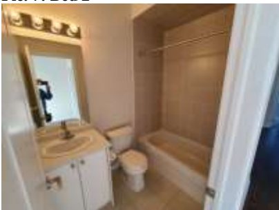
Pic. 10: 3rd floor bath