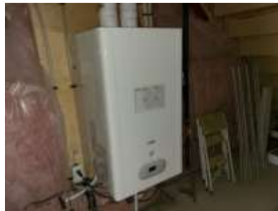
Pic. 23: Tankless hot water boiler