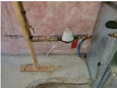
Pic. 22: Water main