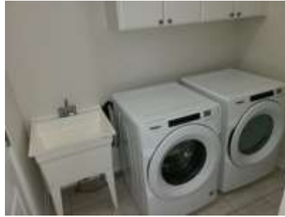
Pic. 17: Laundry