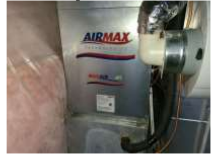
Pic. 21: Forced air hot water furnace