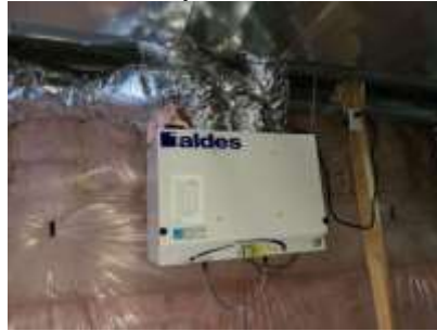
Pic. 20: HRV