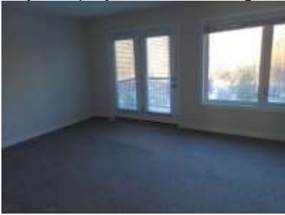
Pic. 16: Rec room