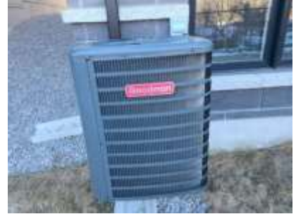
Pic. 3: AC unit