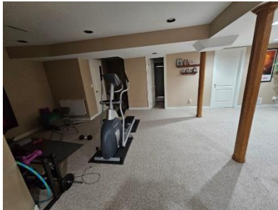
Pic. 26: Rec room