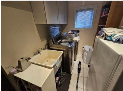
Pic. 25: Laundry