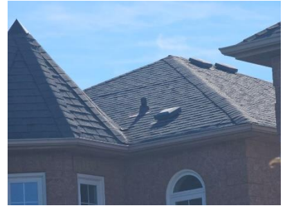
Pic. 3: Updatd roof covering