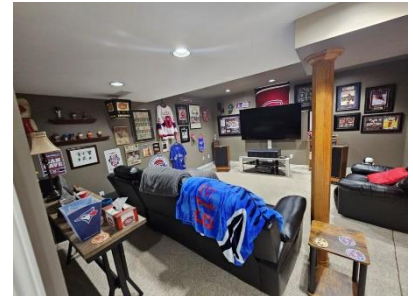
Pic. 27: Rec room