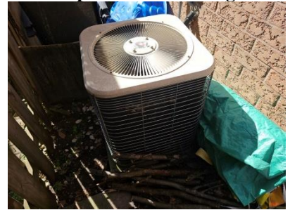
Pic. 6: AC compressor 1999