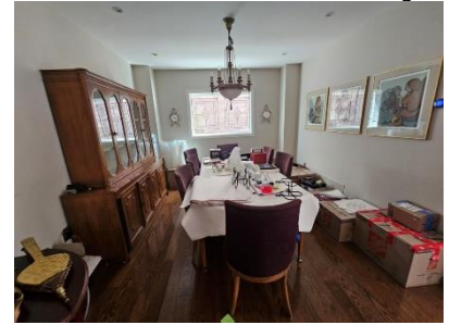
Pic. 18: Dining room