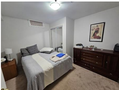
Pic. 28: Bedroom 5