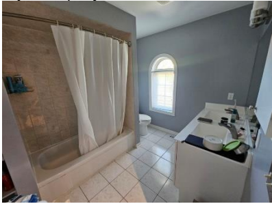
Pic. 16: 2 nd floor bathroom