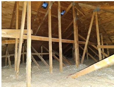
Pic. 8: Attic – updated insulation level