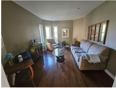
Pic. 17: Living room