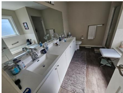
Pic. 11: Primary bathroom