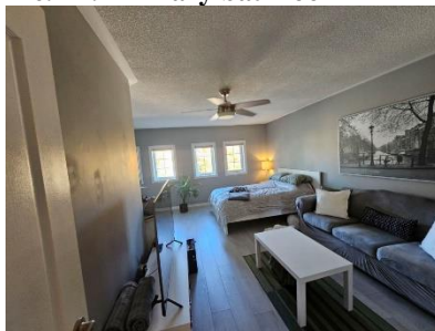
Pic. 14: Bedroom 3