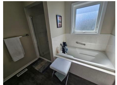
Pic. 12: Primary bathroom