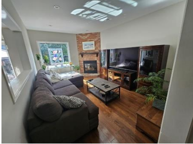
Pic. 19: Family room