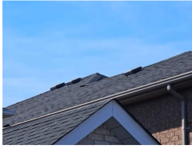
Pic. 2: Updated roof covering