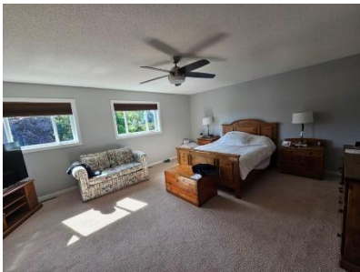
Pic. 10: Primary bedroom