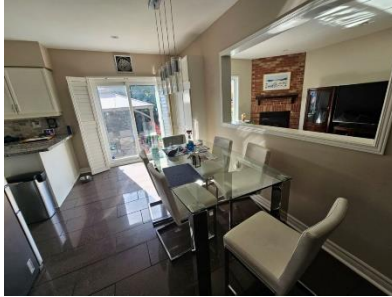
Pic. 20: Eating area