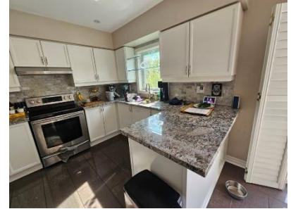
Pic. 21: Kitchen