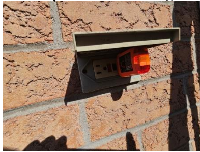
Pic. 5: Rear GFCI defective