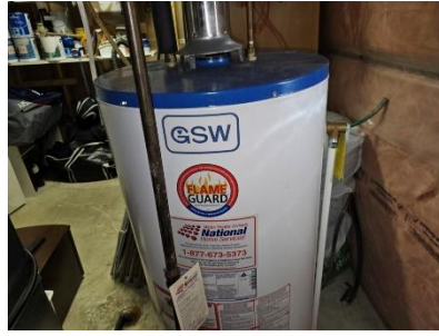
Pic. 32: Hot water tank 2008