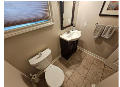
Pic. 24: Powder room