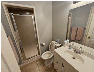
Pic. 29: Basement bathroom