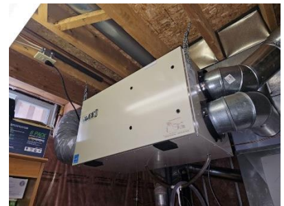
Pic. 30: HRV system