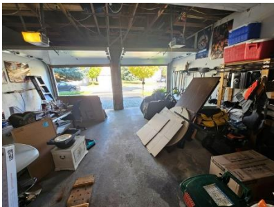
Pic. 7: Garage