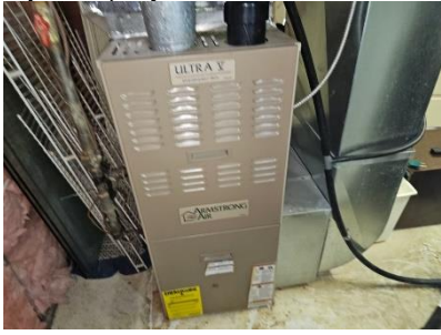
Pic. 31: Gas furnace 2006