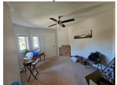
Pic. 15: Bedroom 4