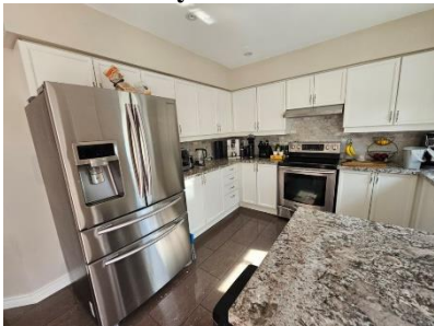
Pic. 22: Kitchen