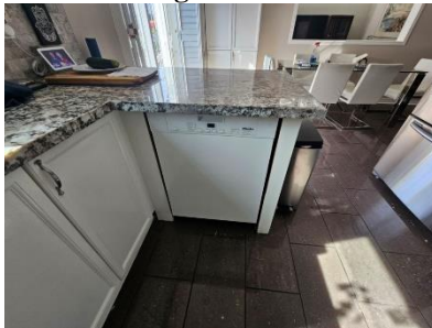
Pic. 23: Kitchen