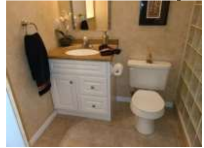
Pic. 33: Basement bath