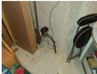
Pic. 38: Water main