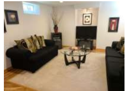
Pic. 30: Rec room