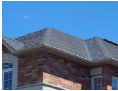
Pic. 2: Update roof covering