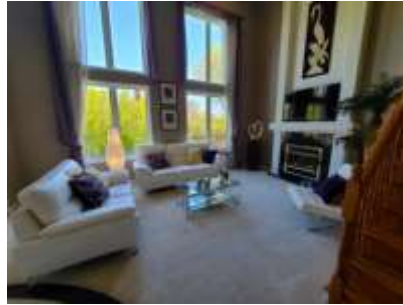
Pic. 20: Family room