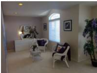
Pic. 10: Master bedroom