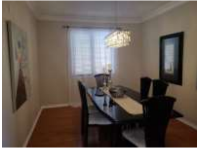
Pic. 19: Dining room