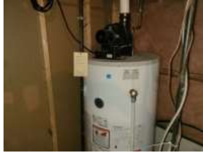
Pic. 35: Owned hot water tank