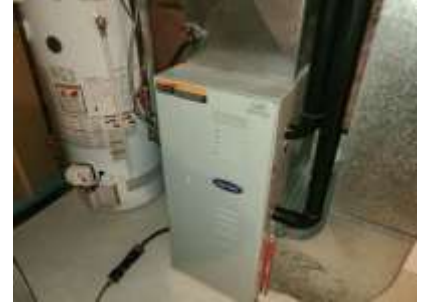
Pic. 36: Original gas furnace 2000