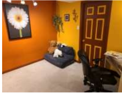
Pic. 32: Basement room