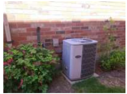
Pic. 3: Original AC unit 2000