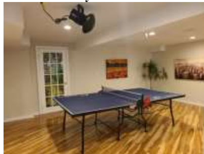
Pic. 29: Rec room