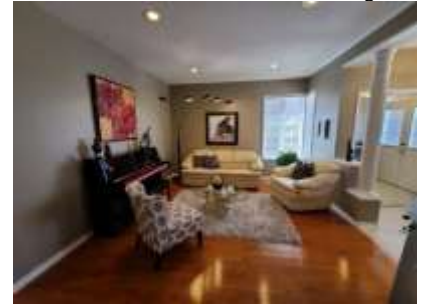
Pic. 18: Living room