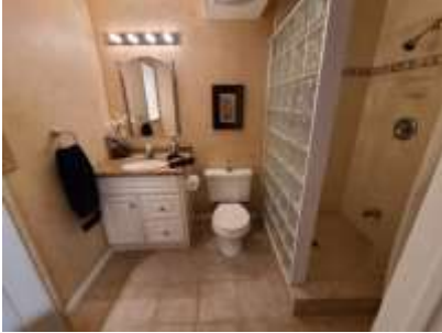
Pic. 34: Basement bath