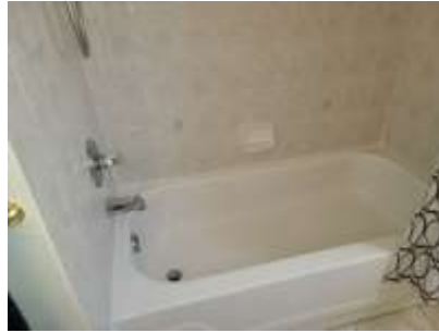
Pic. 17: 2 nd floor bath