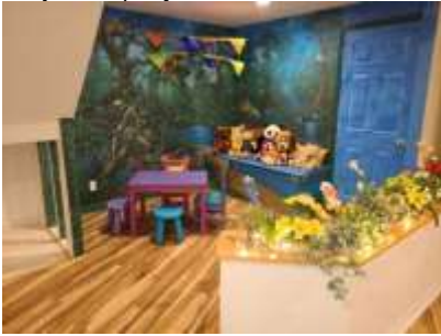
Pic. 31: Rec room