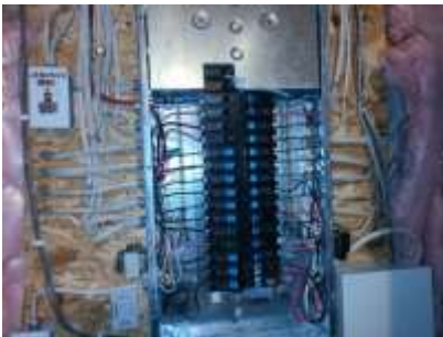
Pic. 37: 100 amp breaker panel