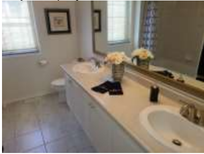
Pic. 16: 2 nd floor bath