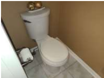
Pic. 25: Powder room