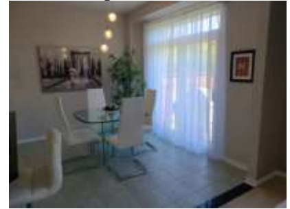
Pic. 21: Eating area