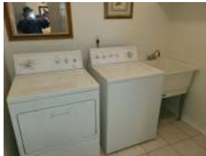
Pic. 26: Laundry