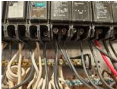
Pic. 53: Several breakers are double tapped