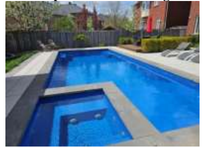
Pic. 6: Inground pool