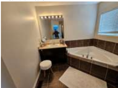
Pic. 22: Primary bathroom