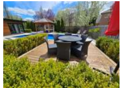
Pic. 15: Deck