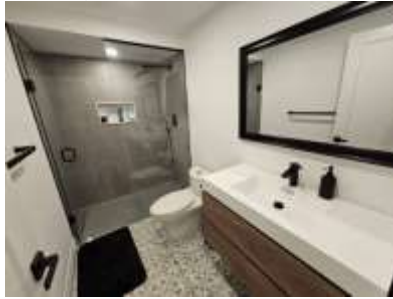
Pic. 47: Basement bathroom