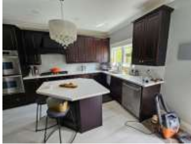
Pic. 35: Kitchen