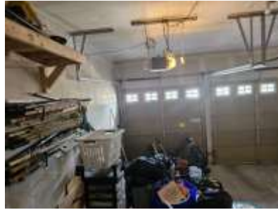
Pic. 17: Garage