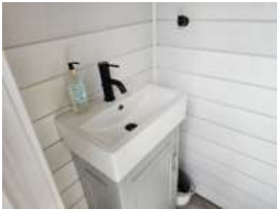
Pic. 10: Cabana bathroom