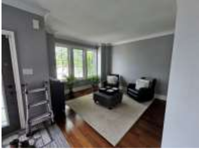
Pic. 31: Living room