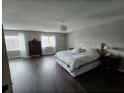
Pic. 20: Primary bedroom