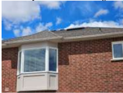
Pic. 5: Rear roof covering updated