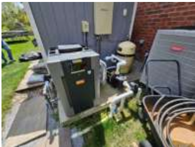
Pic. 13: Pool equipment