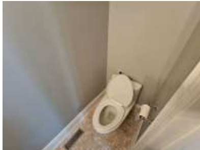
Pic. 41: Powder room