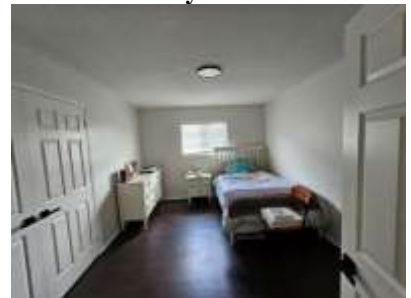
Pic. 27: Bedroom 3