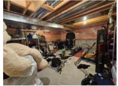
Pic. 48: Unfinished basement area