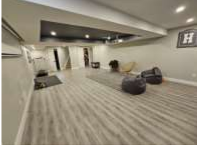
Pic. 46: Rec room