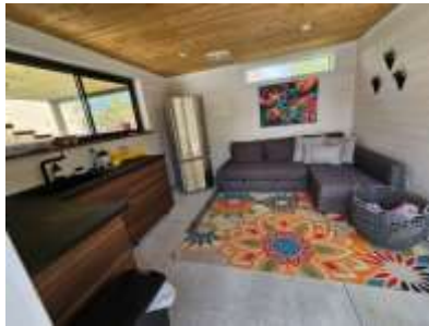
Pic. 11: Cabana