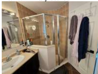
Pic. 23: Primary bathroom