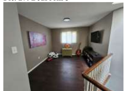
Pic. 30: Loft area