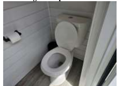
Pic. 9: Cabana bathroom