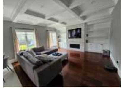
Pic. 33: Family room