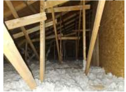
Pic. 18: Attic