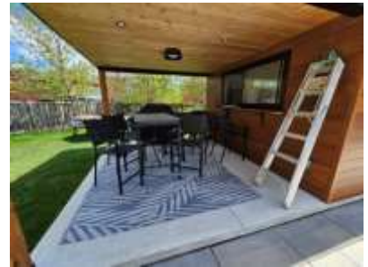
Pic. 12: Patio area