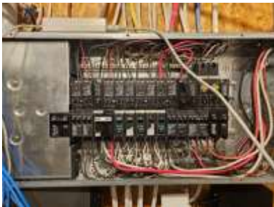
Pic. 52: 100 amp breaker panel