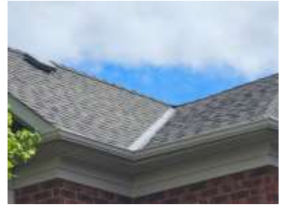
Pic. 3: Updated roof covering