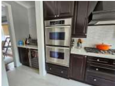
Pic. 38: Kitchen