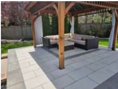
Pic. 7: Patio