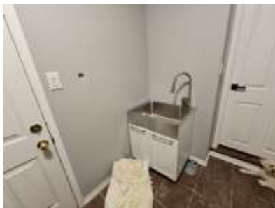
Pic. 44: Laundry