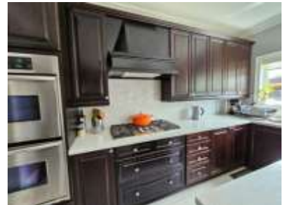
Pic. 39: Kitchen