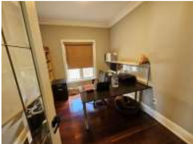
Pic. 40: Office