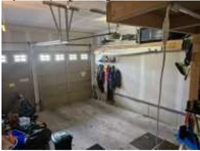
Pic. 16: Garage