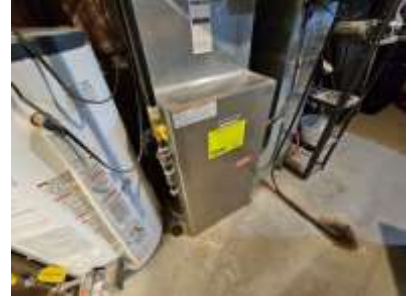
Pic. 51: Original gas furnace