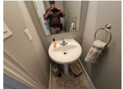
Pic. 42: Powder room