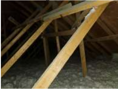
Pic. 19: Attic