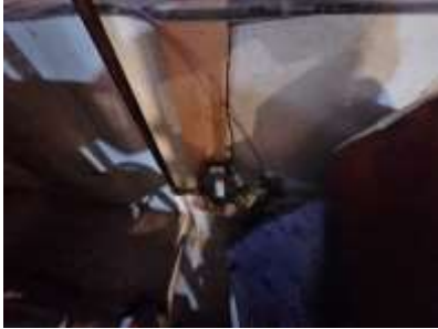
Pic. 49: Water main