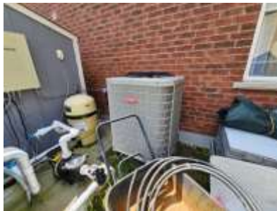
Pic. 14: Original AC unit