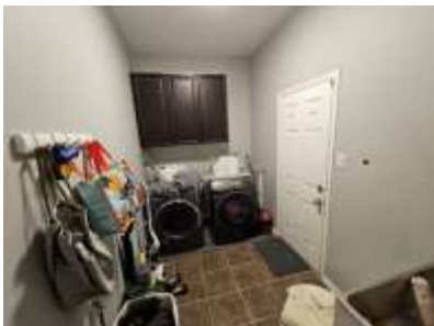
Pic. 43: Laundry