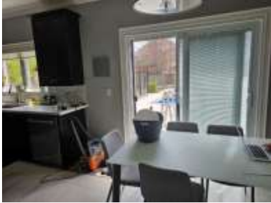
Pic. 34: Eating area