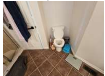
Pic. 24: Primary bathroom