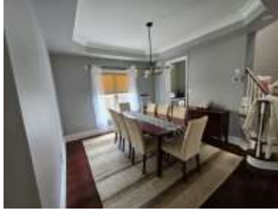
Pic. 32: Dining room