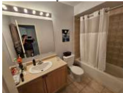
Pic. 26: Ensuite