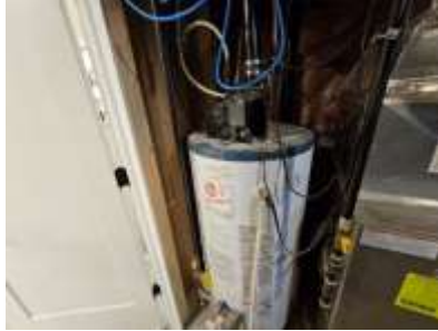
Pic. 50: Rental hot water tank 2005