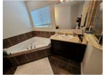
Pic. 21: Primary bathroom