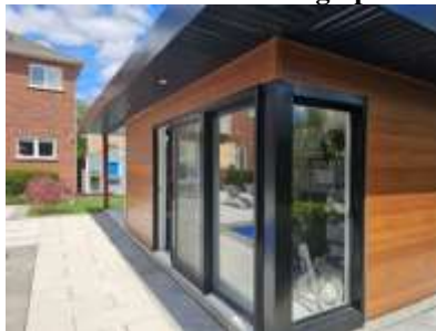
Pic. 8: Cabana