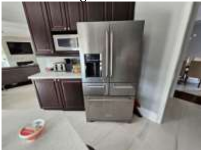
Pic. 37: Kitchen