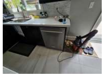
Pic. 36: Kitchen